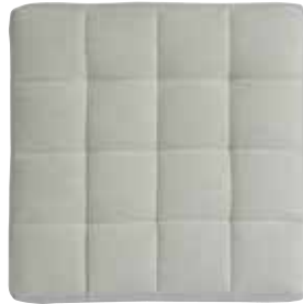
(Q) Box Quilted