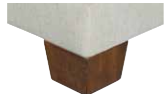
(W) Wooden Leg (Available in all finish options)