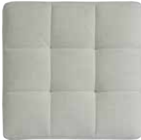
(B) Biscuit Tufted