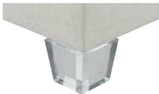
(A) Acrylic Leg